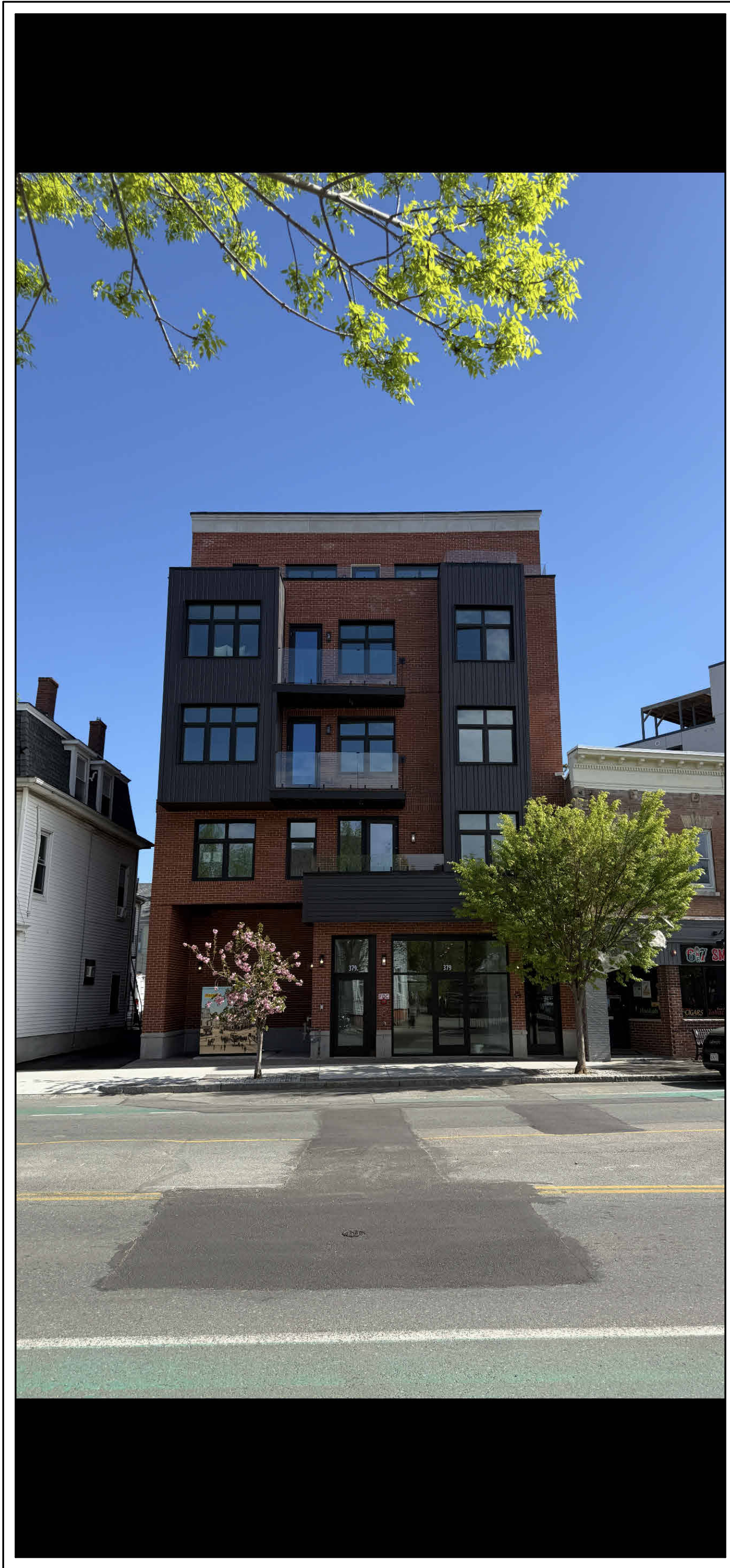
TRANSFORMER WITHOUT ENCLOSURE