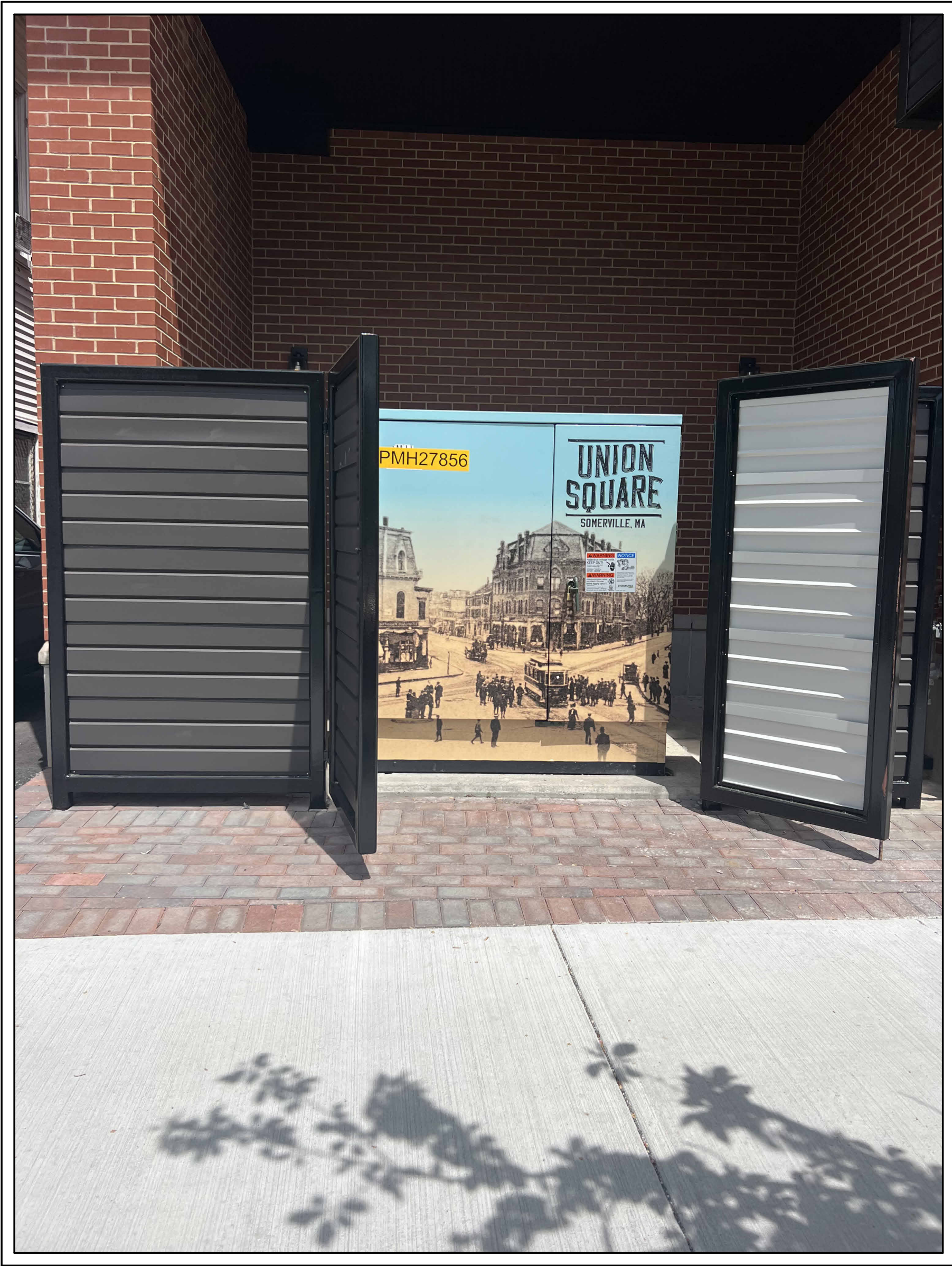
TRANSFORMER WITH ENCLOSURE